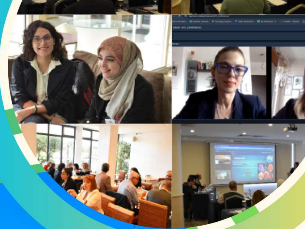
PHOTO SESSION and COFFEE BREAK